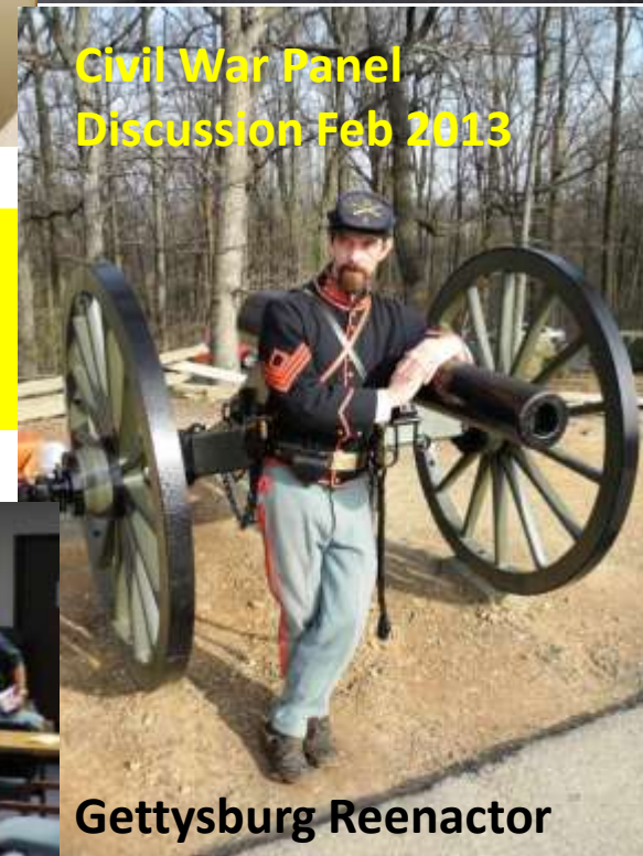
Civil War Panel Discussion Feb 2013