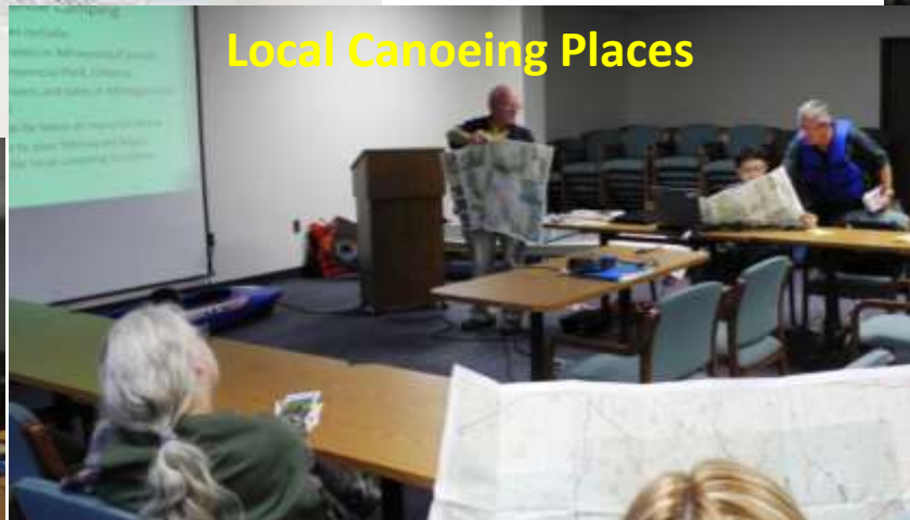
Local Canoeing Places