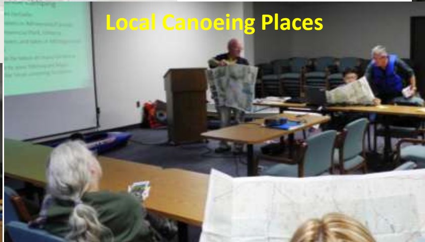
Local Canoeing Places